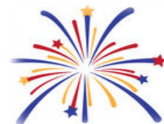
Illustration: ©2014 LCI